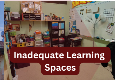
Inadequate Learning Spaces