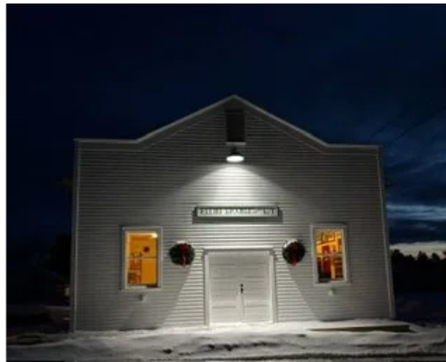
Elcho Grange Hall Number 671