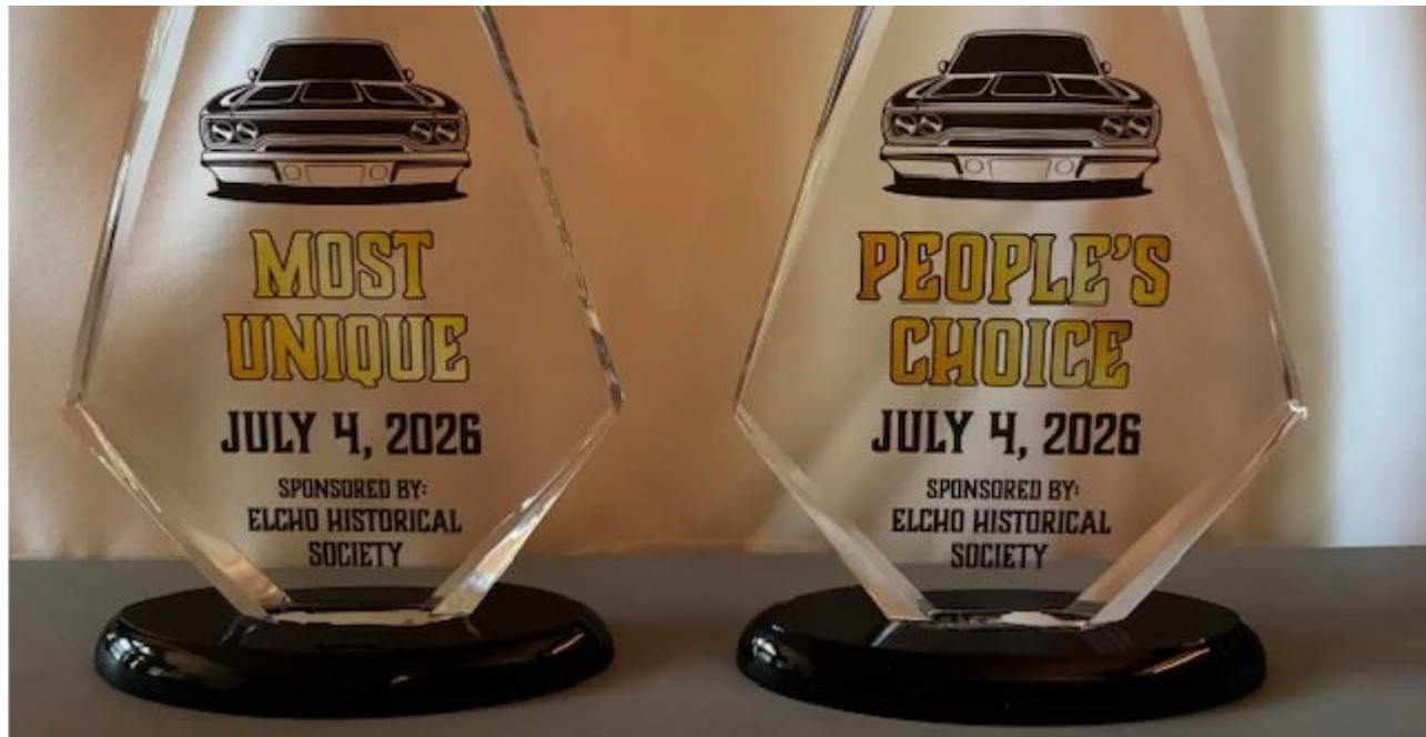
Car Show Trophies

From 10:00 a.m. until 2:30 p.m. there will be a tractor, boat and car show. Ballots will be available for voting and trophies will be awarded at 3:00 p.m. In addition, each participant will receive a very patriotic dash plaque. There are spots available. Do you have a car, boat or tractor you might want to show? Please reach out to us at info@elchohistoricalsocietyinc.org for a registration form. There is absolutely no fee for any of the shows.